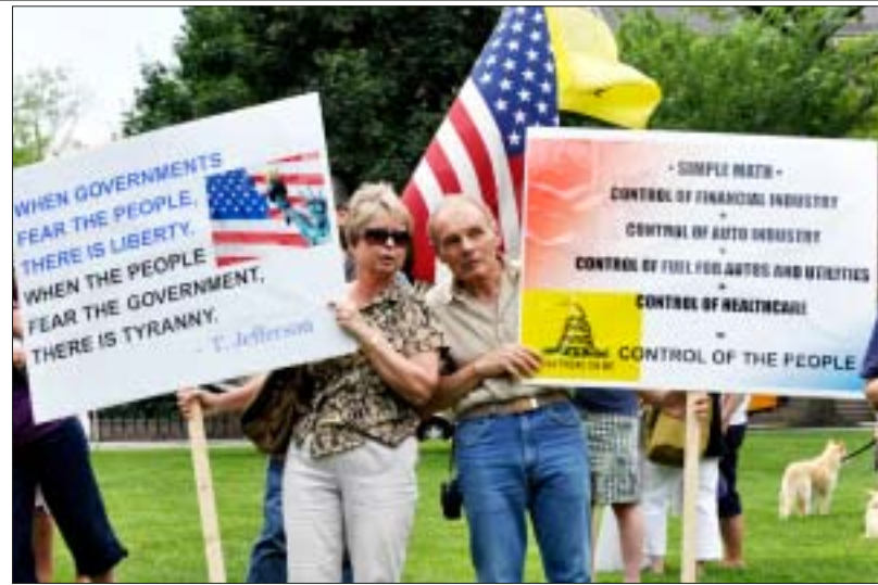
Susan Dougherty for The Westfield Leader and The Times ONE LUMP OR TWO...More than 100 demonstrators in Summit make clear their opposition to current federal government programs by holding a TEA Party (Taxed Enough Already) on July 3. The event was organized by NJ Citizens for Liberty, www.njcitizensforliberty.com. Their theme called for "fellow patriots in America to celebrate independence, liberty and freedom."