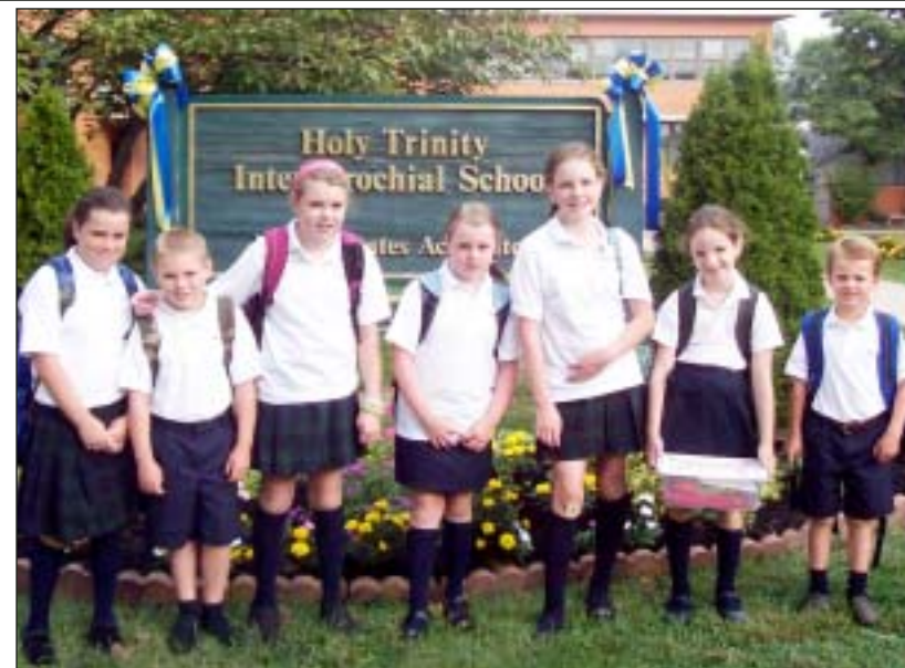
BACK TO SCHOOL...On September 3, students returned to Holy Trinity Interparochial School's Westfield campus. Holy Trinity Catholic School offers a curriculum for grades Pre-K to eighth grade.

For more information, contact Jeni at (908) 889-1636 or Jeni@WelcomeHome123.com .