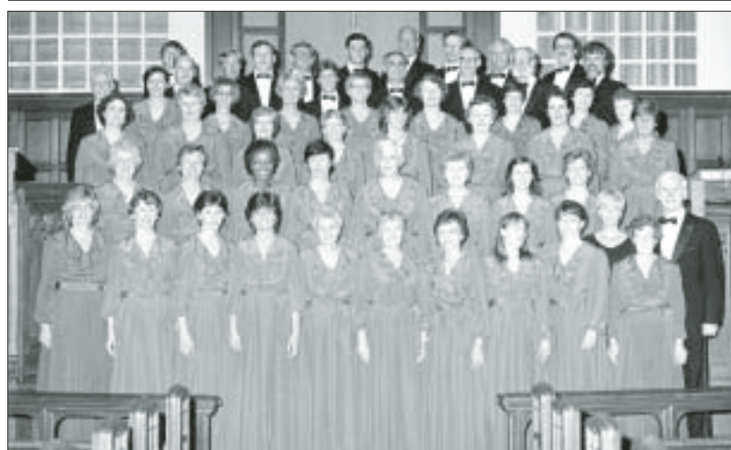
GETTING THE GANG BACK TOGETHER...The First United Methodist Church (FUMC) of Westfield's Wesley Singers, pictured above, a prominent choir of the last four decades, will reunite this coming weekend.