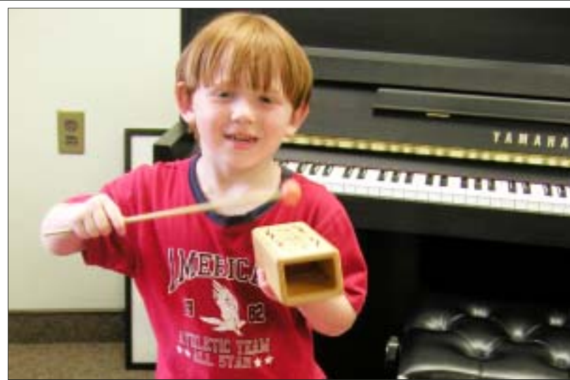
IMAGINE THE POSSIBILITIES...Children ages 3 to 5 will learn music as part of the curriculum of Kids 'n' Arts, a drop-off program in art, music and drama sponsored by the New Jersey Workshop for the Arts.