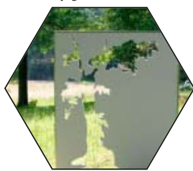
Missing Tree # 3 Location: Great Swamp

To see the exhibit, take Route 1 South to the Woodbridge Avenue Exit towards Highland Park. The exit will be on your right. Stay on Woodbridge Avenue until Crowell's Road. Make a left on Crowell's. Continue until the road ends and bear right onto Donaldson Avenue. The sculpture will be on the left-hand side.