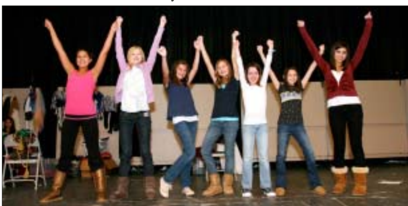
COMICAL SPIN ON A CLASSIC...Roosevelt students promise that the comedic Somewhat True Tale of Robin Hood will be a rollicking good time.