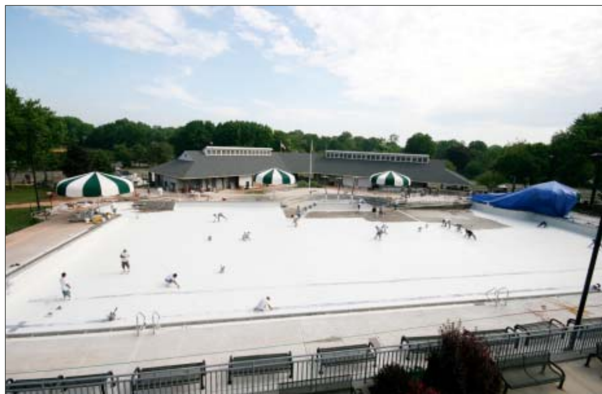
READY FOR THE HEAT WAVE...Last weekend, workers put the final touches on the Westfield Memorial Pool Complex before filling it with water. After a one-week postponement, the pool is being given finishing touches to be ready for the Saturday, June 14, opening. Extreme weather conditions were said to have caused the opening date to be pushed back. See pool photographs at goleader.com/photos.