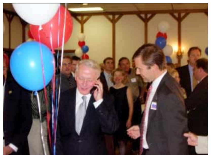
VICTORY AT LAST...State Senator Leonard Lance receives the Primary election results Tuesday night at his campaign headquarters in Flemington as Senator Tom Kean, Jr. of Westfield listens at right.

Times that he intends to campaign "vigorously," and believes his views "are the views of the overwhelming majority of the people of this congressional district," pointing specifically to "fiscal responsibility, social moderation and strong environmental protection." He also said that Sena-