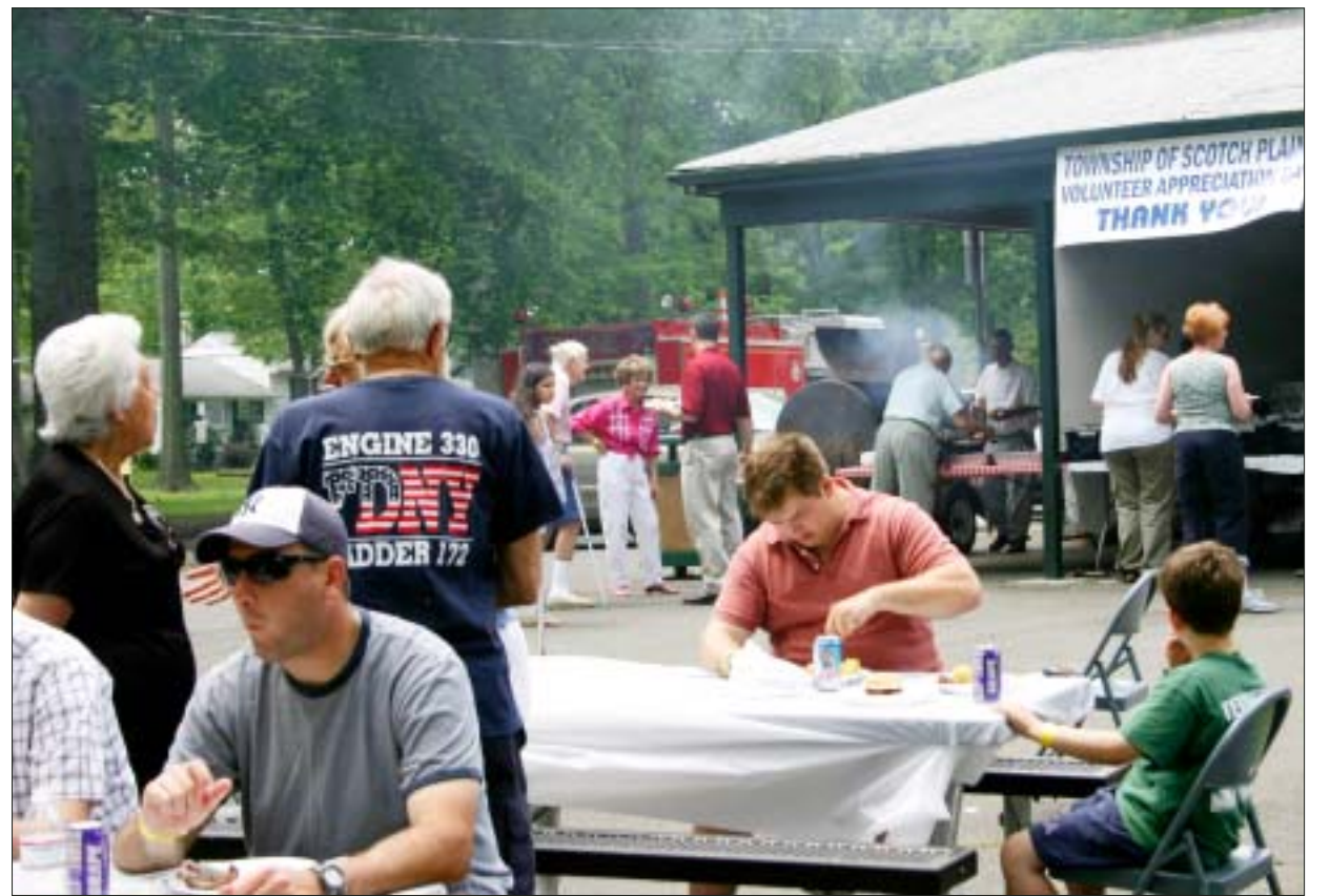
A TOWNSHIP FIRST...The weather cooperated for the first annual Scotch Plains Volunteer Picnic on Sunday, held at Brookside Park. Volunteer firemen, members of the rescue squad, members of the township's boards and commissions their families, Scotch Plains council members and a host of other town residents attended the event.

The measure would "restrict" certain types of land uses — including nail salons and fast food and take-out