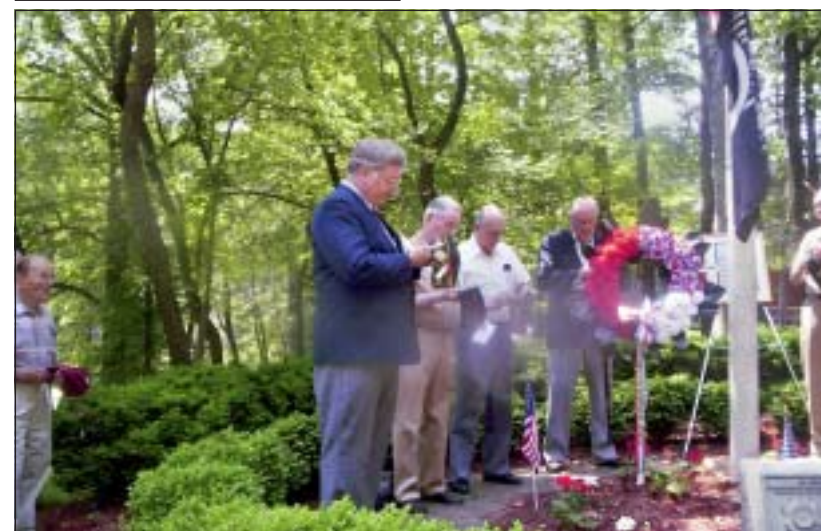
LASTING TRIBUTE...Members of the Mountainside Veterans of Foreign Wars commemorate fallen heroes outside at a veterans memorial on Memorial Day.

Allstate New Jersey's #1 Home Insurance Agency in 2004 and 2005