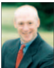
GREGORY MCDERMOTT (R)