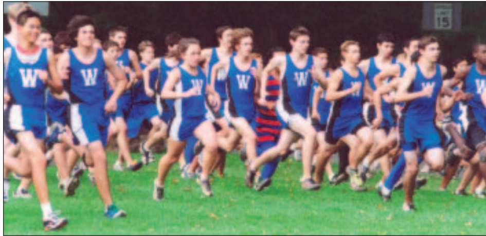
A MASSIVE BLUE DEVIL PACK...THE BLUE DEVIL BOYS CROSS-COUNTRY TEAM MADE BIG WAVES AT THE MEET OF CHAMPIONS.