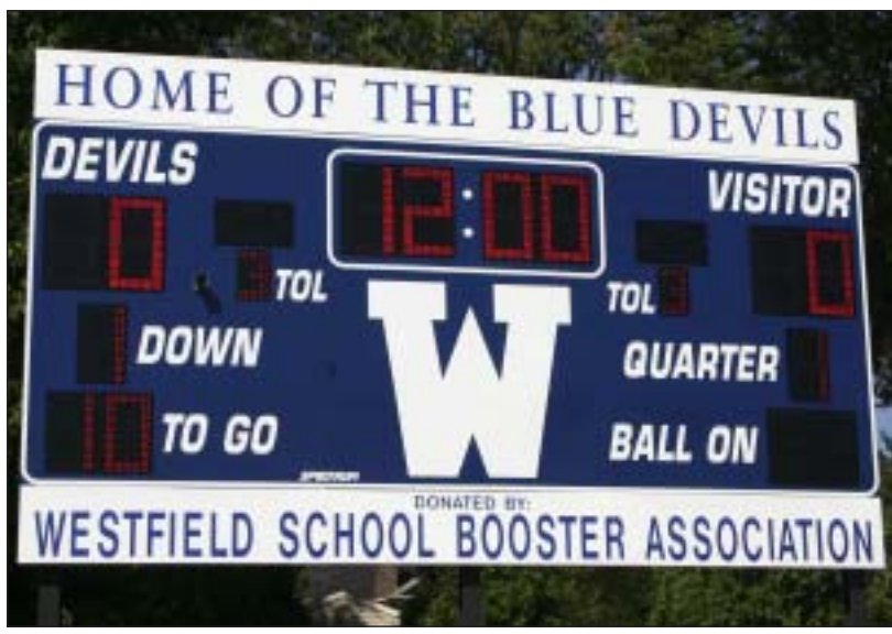
BRAND SPANKING NEW...The Westfield Booster Club donated a brand, spanking new scoreboard for Kehler Stadium.