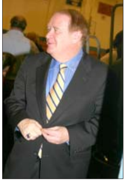
I LOVE THIS GAME......New Jersey acting Governor Richard Codey liked what he saw in the NJSIAA, North Jersey, Non-Public semifinal game between Union Catholic and Mt. Saint Dominic in West Orange.