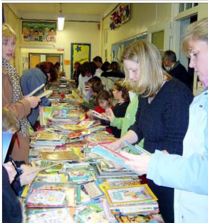
CHARITABLE ACT... Close to $1,000 was raised for charity by the student-run community service club, "Early Act," at McKinley Elementary School in Westfield when the group sold gently used books donated by McKinley parents. Profits from the sale, which was held on Family Reading Night on January 20, will be donated to one or all of three charities chosen by the student members.