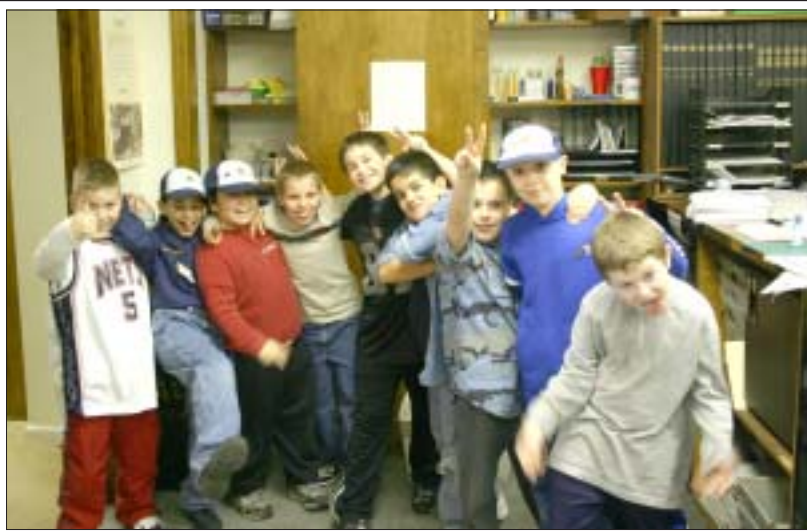
BEARS VISIT...Bear Cub Scouts from Hehlny School in Clark visited the Leader/Times office on February 3 to learn how a newspaper is made.

For the complete WCT-TV36 schedule listing, please tune into the WCT-TV36 Community calendar or visit westfieldtoday.com/WestfieldCommunityTelevision .