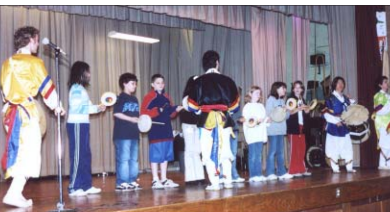
DANCING DRUMMERS...Students at Jefferson Elementary School in Westfield were introduced to the Nori Company, a traditional Korean Drum and Dance Ensemble, at a Parent-Teacher Organization-sponsored Cultural Arts assembly. The experts explained that lively drumming and dancing have been performed since ancient times in Korea as part of ritual ceremonies to ward off evil, to pray for rain, or to celebrate harvesting of crops. Students also learned that rhythms and movements have been incorporated into the marking of special occasions. Pictured above, fifth graders learn some drumming and dancing tips.