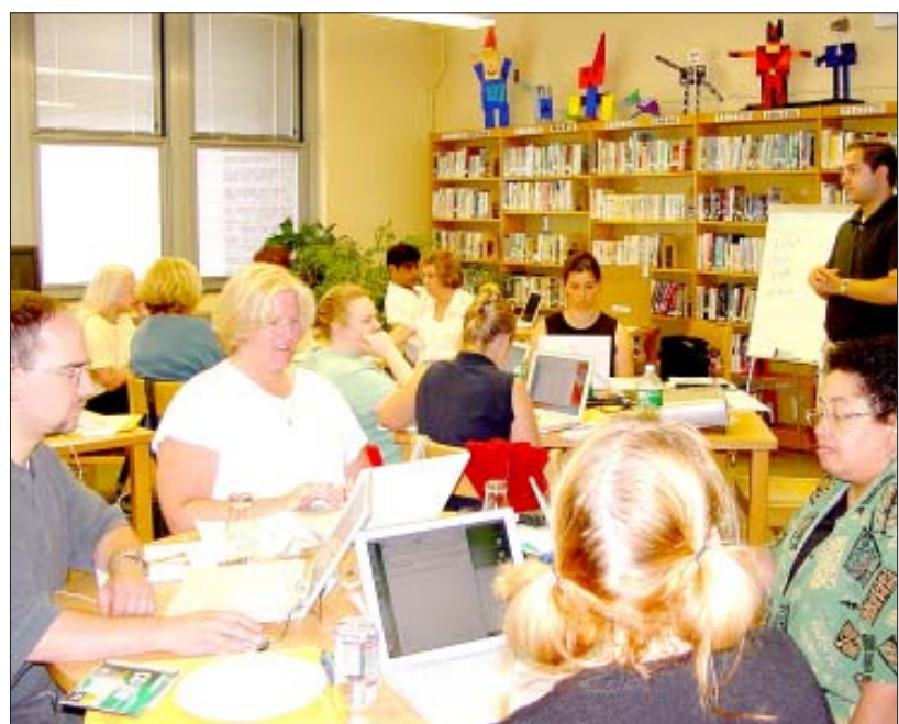
LEARNING NEW SKILLS... This summer, the Apple Computer consultant oriented Westfield turn-key teachers in the use of the new Macintosh operating system. Turn-key teachers will disseminate instruction on using the new operating system to all district Macintosh users throughout the summer and fall.