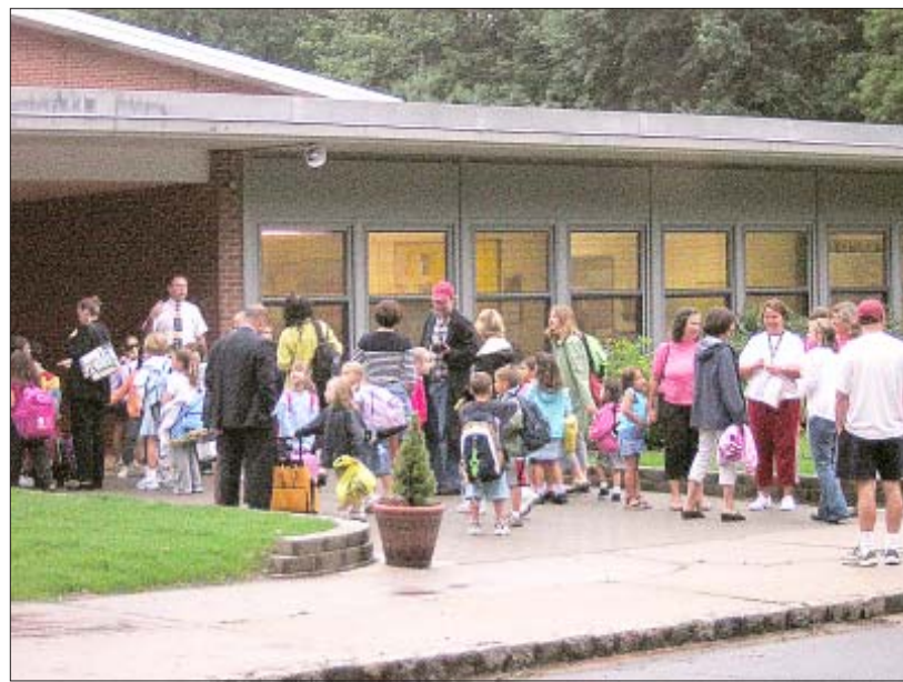
OPEN FOR BUSINESS...Eager students, some accompanied by their parents, scurried to the doors of Tamaques Elementary School, left, and Edison Intermediate School, right, to usher in the first official day of school for the 2003-2004 academic year in Westfield.