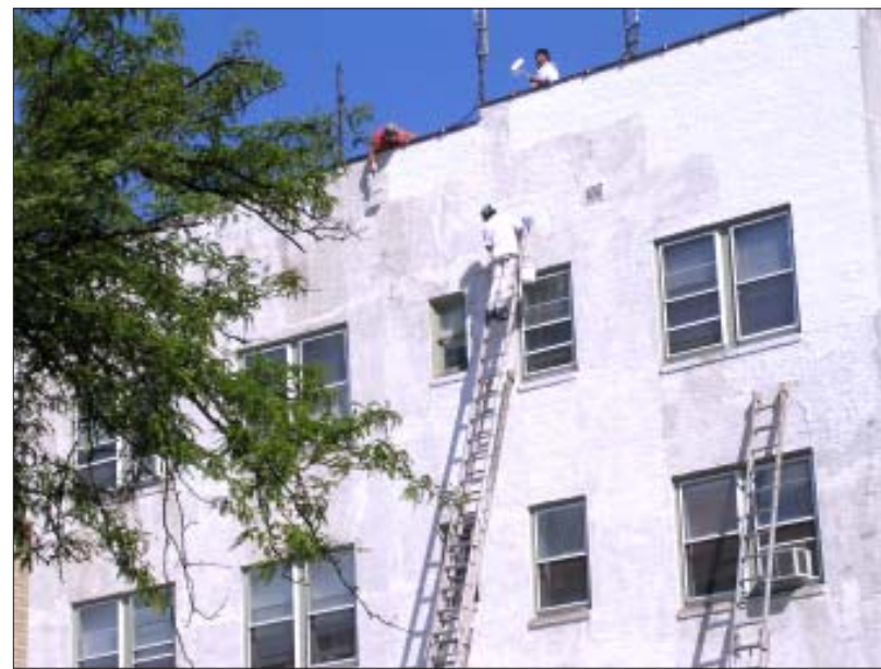
A LOT OF PAINT... The south side of the four story building on Elm Street was painted on Sunday. It took 30 gallons of paint and two days to paint the one side of the building according to painter Thomas Anastasiou.

Check Us Out on the Web: www.goleader.com!