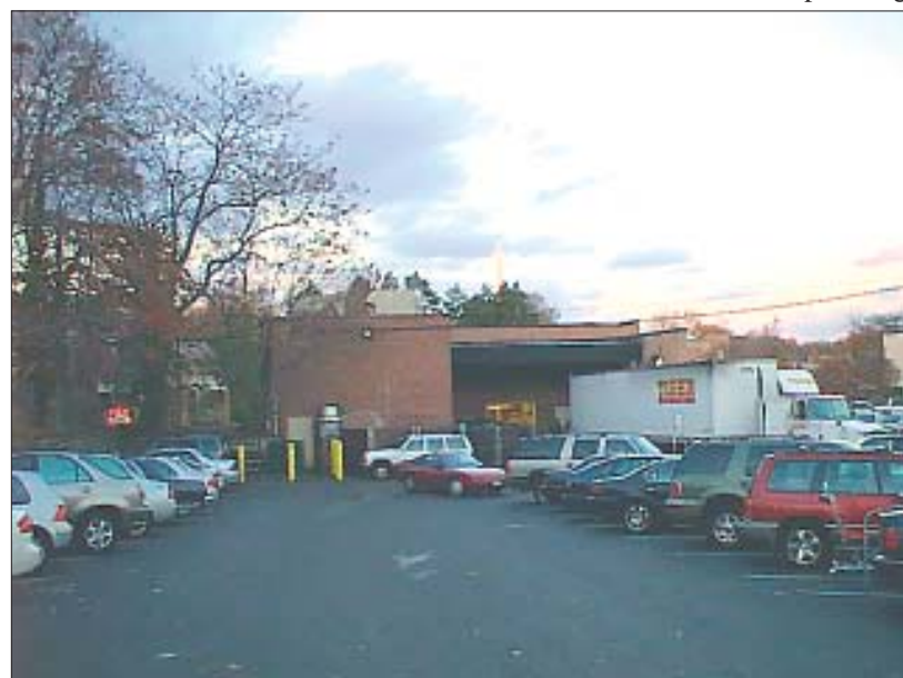
BUILDING UP?... The owners of the Trader Joe's building on Elm Street have applied to add two stories to the building for commercial and residential space. This would block the current view of the Presbyterian Church steeple as pictured above.