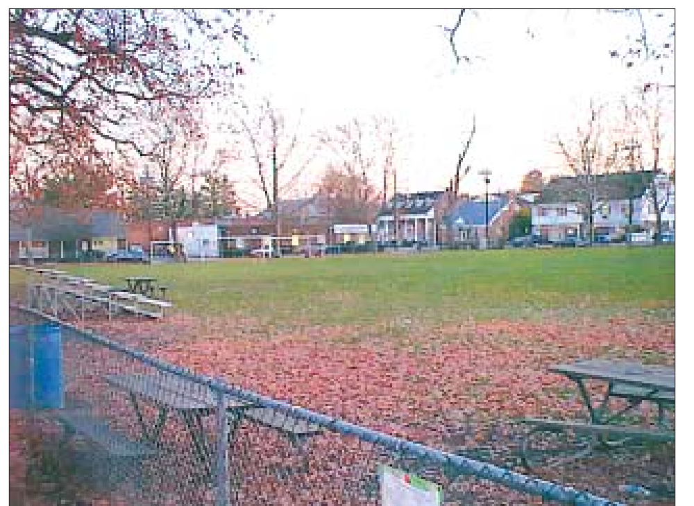
FIELD OF TREES?... The Elm Street Field, across from the Stop and Shop Supermarket, has been the home of the Y's Men's Annual Christmas Tree sale. This year, the Board of Education will once again permit the Y's Men to use the field. However, the board asked the organization to consider moving the sale to the Memorial Pool complex due to continual wear and tear to the Elm Street Field.