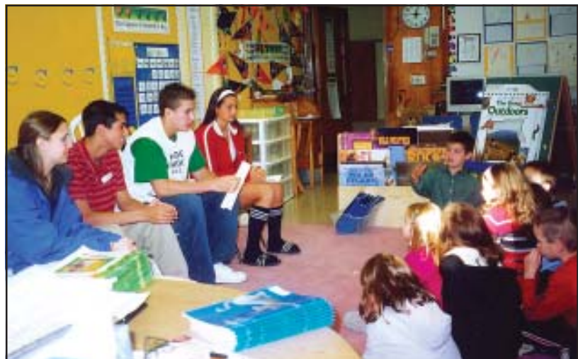
SAYING 'NO'... Mountainside's Deerfield Elementary School second graders and eight Governor Livingston High School TREND Organization members continue the annual joint program for Red Ribbon Week on October 24. Turning recreational activities in new directions, members read the Dr. Seuss book, "Hunches in Bunches," as part of their discussion with a class about saying no to drugs and making the right choices.

The Society was established on the principle that with scholarship comes a responsibility to develop leadership and a duty to perform service.