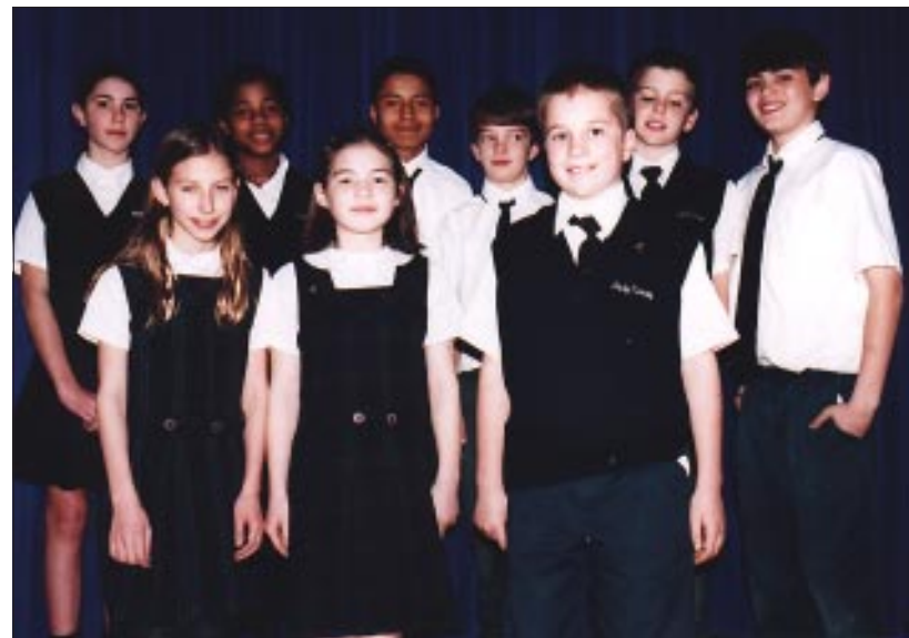
GOOD CITIZENS, GOOD CHRISTIANS...Holy Trinity Interparochial School in Westfield proudly announced the recipients of the school's Christian Citizen-ship Award for the second marking period. Pictured, above, are the students from fifth to eighth grades at the school receiving the Award.