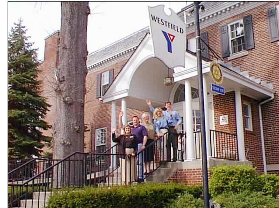
The Westfield Y

which successfully fought to preserve the building as a theater. Today, the Rialto Theatre features six screens and remains an entertainment hub in the downtown. People can often be seen waiting outside for tickets to the latest movies.