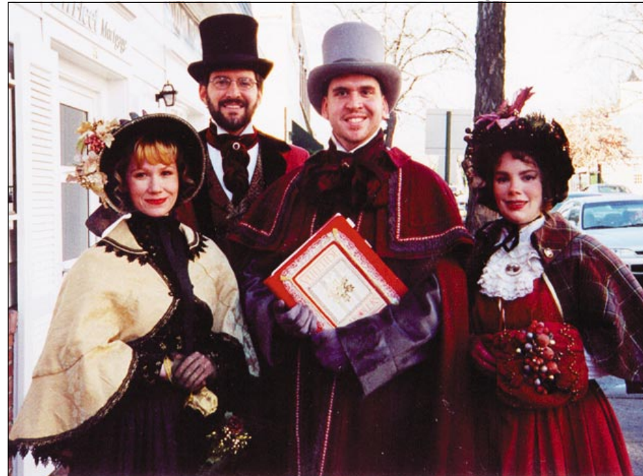
A PAGE OUT OF HOLIDAY HISTORY... Members of the Yuletide Carolers entertained shoppers on December 4 as part of the Downtown Westfield Corporation-sponsored event, "Welcome Home to Westfield."

Citizens interested in joining one of the DWC volunteer committees are encouraged to call (908) 789-9444, or visit the corporation's office at 105 Elm Street in the Fleet Bank building, second floor.