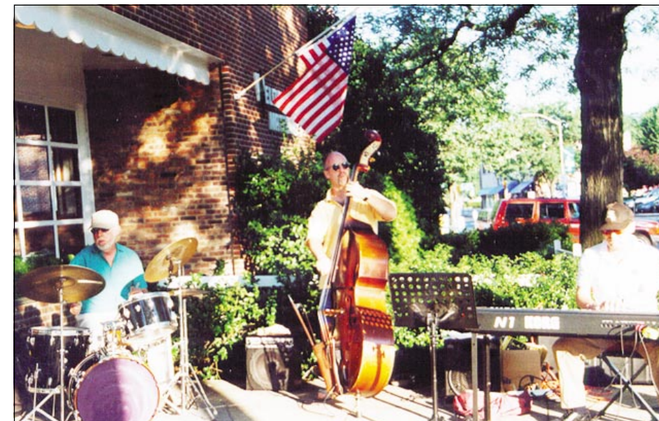
HOW SWEET IT IS... The Sweet Sounds Downtown Festival, sponsored by the Downtown Westfield Corporation last July, included different musical flavors and bands.

Summit Bank offers a complete range of personal and business services to meet your total banking needs.