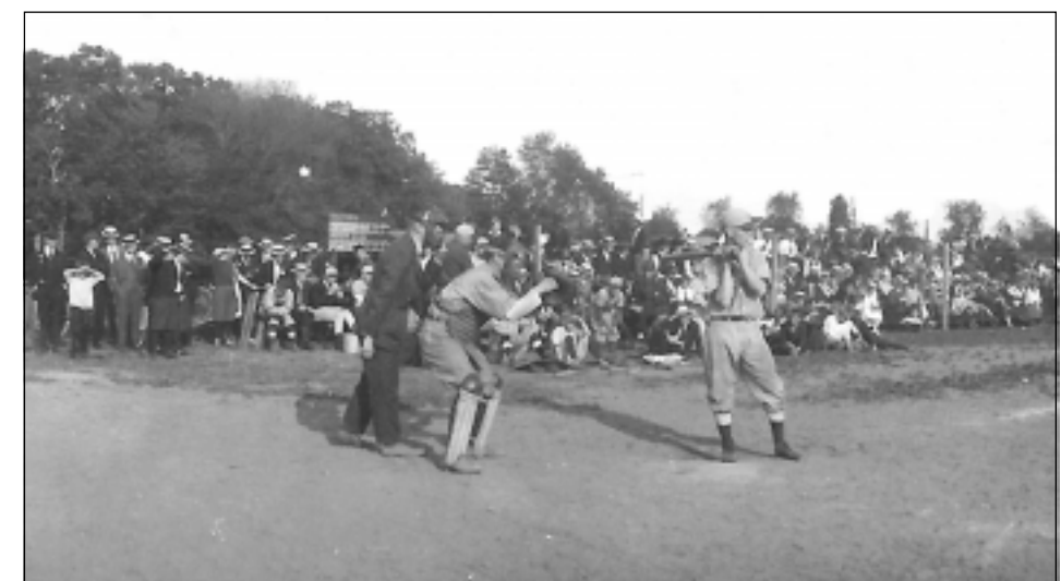
DRAWING PLENTY OF ATTENTION... This 1921 baseball game played at Recreation Field, now Kehler Stadium, drew plenty of curious fans. During that era, baseball was the "National Pastime" and football was on the rise.