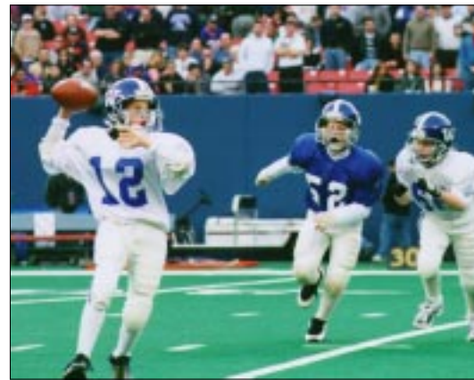
Devil verses Devil at Giants Stadium

by the Westfield PAL D football team when they got the opportunity to play before 78,000 fans at Giants Stadium during half-time of the Giants-Jets game on December 5. On the same date in 1977, the Westfield High School football team won the state champion-