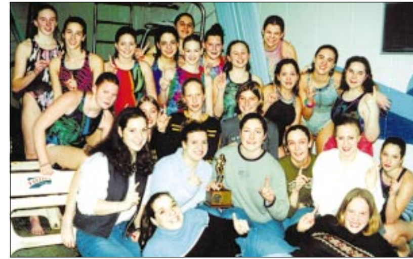
The Blue Devil girls swimming team won the Public B State title in 1999 and could have claimed the 2000 A Division crown on a judge ruling but opted not to, stating that they would have rather done it in the water.