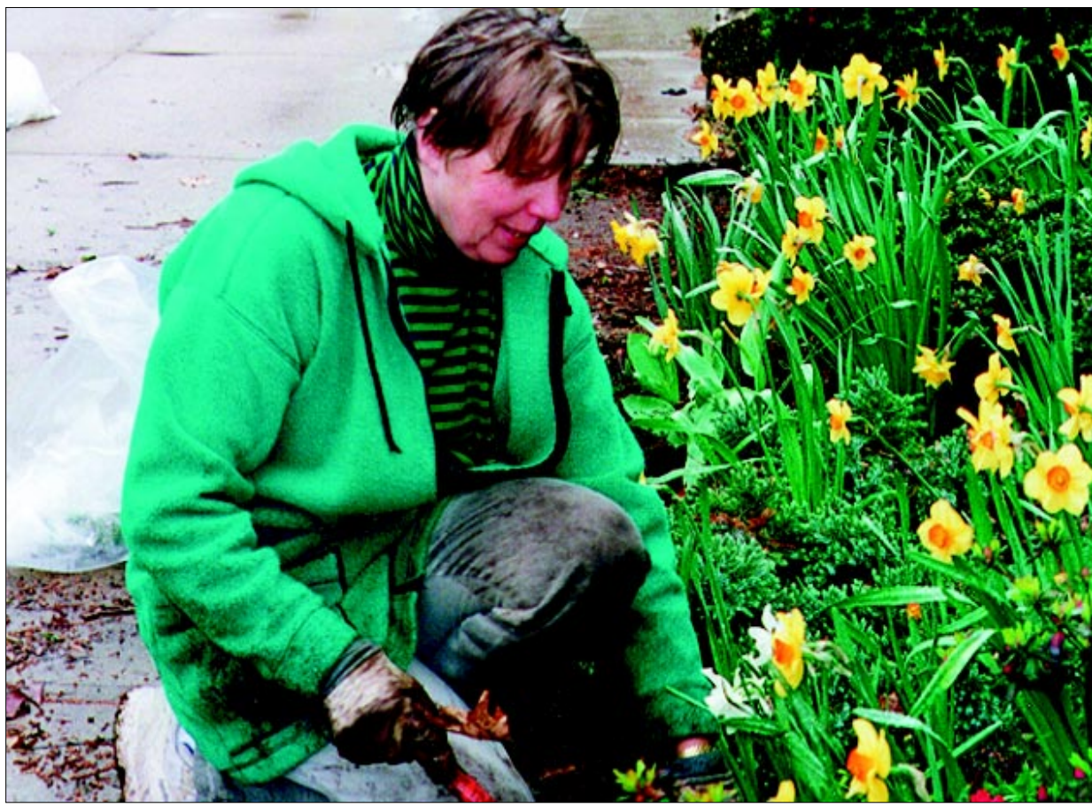
KEEP MINDOWASKIN BEAUTIFUL...Maintaining the beauty of Mindowaskin Park in Westfield, even on such a dreary day, was a priority for this resident as she weeded among a small gathering of yellow daffodils.