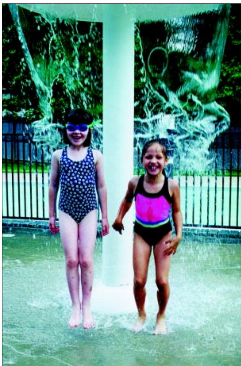
SPLASH WATERFALL...In an effort to beat the heat, two Westfield youngsters braced themselves for the cool stream of water overhead at the Memorial Pool in town.