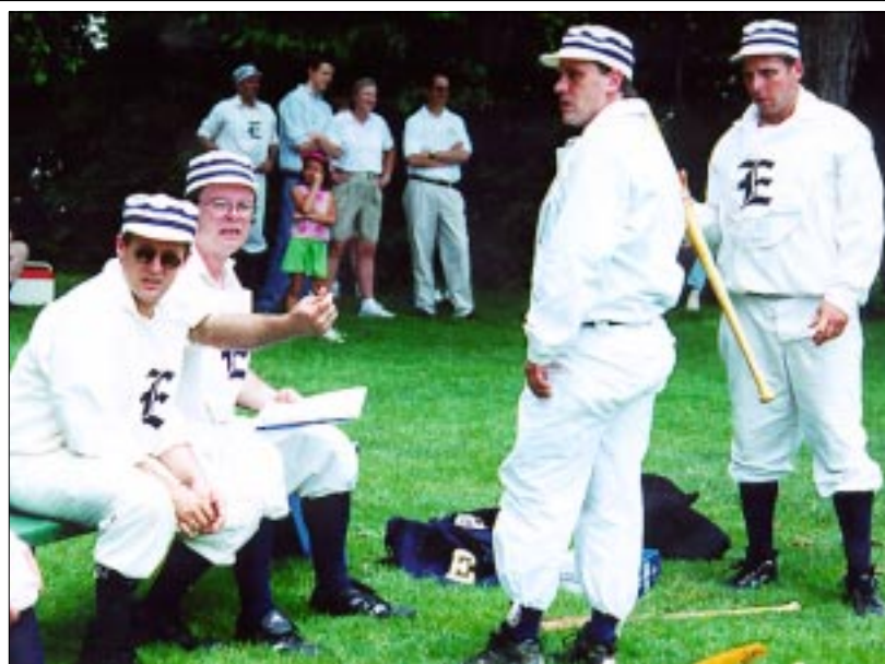
TALKING IT OVER...Members of the Elizabeth Resolutes talk over action during the 1860's style base ball game with the Atlantic Base Ball Club.

The Hawks then won the championship by defeating the Clifton Cobras, 10-3.